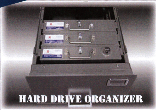
HARD DRIVE ORGANIZER