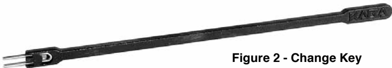
Figure 2 - Change Key